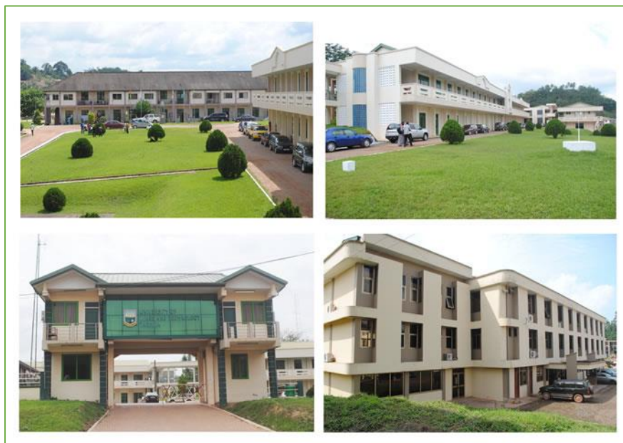
UMaT – MAIN CAMPUS IN TARKWA

Under the aegis of ParisTech, I am pleased to announce the online scientific workshop on "Geosciences" on Wednesday 26th May 2021 between UMaT and Research Department of MINES-ParisTech .